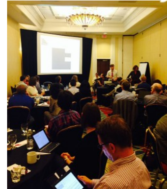
Breakout session at Digital Preservation 2014.

Digital Preservation 2014 , held July 22-24, marked the 13 th major meeting hosted by NDIIPP in support of the broad community of digital preservation practitioners, and it was certainly the largest, if not the best. This meeting has rapidly evolved to welcome an ever-expanding group of practitioners, ranging from students to policy-makers to computer scientists to academic researchers.