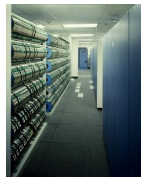
"Computer data storage in a modern office"

So, what is a digital repository? Read the full blog post for the answer.