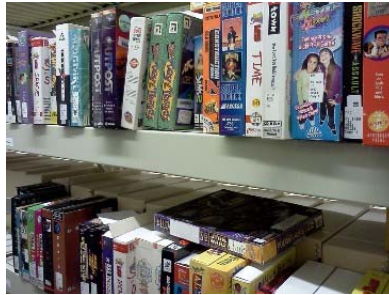
Shelved software at the Library of Congress National Audio-Visual Conservation Center

See more of what's included in this new report.