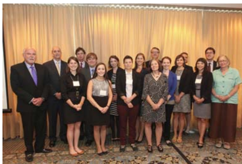
This year's residents.

After years of planning, the staff, hosts, and benefactors are pleased to welcome the 2013-2014 National Digital Stewardship Residency