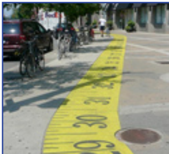
Measuring West

“ The Signal ” featured blog posts about recent activities of two of the five National Digital Stewardship Alliance Working Groups .