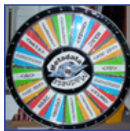
Metadata Madness wheel