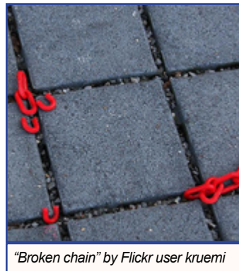
“Broken chain”

By Nicholas Taylor – What is the average lifespan of webpage? Predictably, estimates vary and vary over time. A 1997 special report in Scientific American claimed 44 days. A subsequent 2001 academic study in IEEE Computer suggested 75 days. More