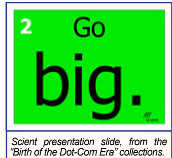
Scient presentation slide, from the “ Birth of the Dot-Com Era ” collections.