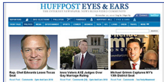
Screenshot from Eyes & Ears. E&E is the Huffington Post’s citizen journalism unit.

NDIIPP organized a two-day workshop in Washington, DC to discuss preserving hyperlocal community news, blog aggregators, social media and user generated reporting. The meeting brought together 45 researchers, bloggers, journalists, academics and archivists to address selection and preservation issues. The meeting built upon discussions at last year’s Preserving Digital News meeting .