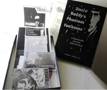
Figure 1. “Feelies” that came with John McDaid’s Uncle Buddy’s Phantom Funhouse (Eastgate 1992), an early example of electronic literature. They are integral to the experience of the work.

macros? What about discussion boards and strategy guides and blogs and cheat sheets, all of which capture the lively user communities around software? What about industrial and enterprise software? What about the software in your car or on a 777? What about software that comes to you nowadays as a service, like YouTube and Twitter? What about mobile apps?