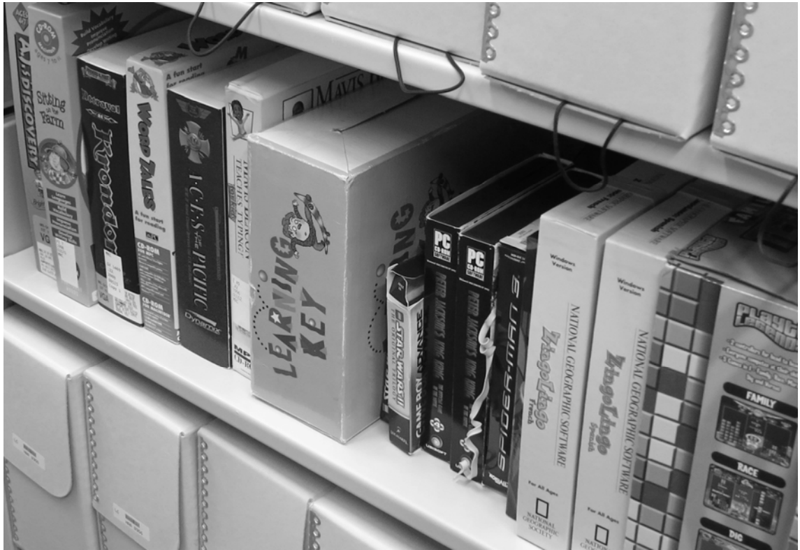
Shelved software from the Library of Congress collection at the National Audio-Visual Conservation Center.