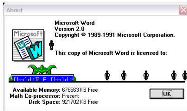
Figure 2. Easter egg activated by a Macro in Word 2.0, illustrating the rivalry with the “W.P.” monster.

is (or should be). Campbell-Kelly singles out 1969, when IBM was threatened with an antitrust action, as the moment in the US industry when software became commercially distinguishable from hardware, through what was known as the “unbundling” decision. A similar antitrust suit would later arise around Microsoft’s bundling of Internet Explorer with its Windows operating system; this time the distinction was between the desktop and the Web. Sometimes software even embeds its own history: Microsoft Word 2.0, released in 1991 at the height of the so-called “word wars” between rival word processing applications, contains an Easter egg (a hidden program feature) that displays an animation of Microsoft coders slaying the “WordPerfect monster” (figure 2). Though seemingly a throwaway gesture, this hidden feature speaks directly to the material element in software, that is the passions, high stakes, and ultimately the humanity (and even humor) that informs it.