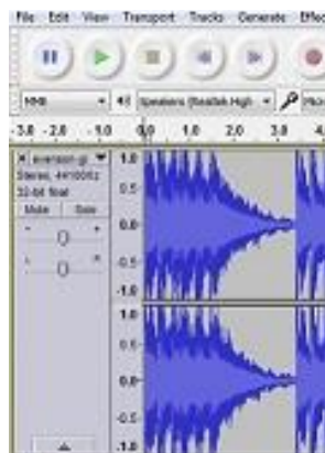
Example of viewing the waveform of an audio recording in Audacity.