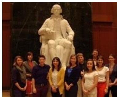
Residents pose with the James Madison statue at the Library of Congress.

Read more about this life changing experience.