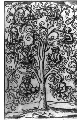
Family tree .

As explained in the Preserving Email report (PDF) from the Digital Preservation Coalition, the exchange of email messages is reliant on sustained interoperability so standardization is essential. Now, let's explore what we've documented so far of the email file format family tree .