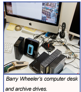
Barry Wheeler's computer desk and archive drives.