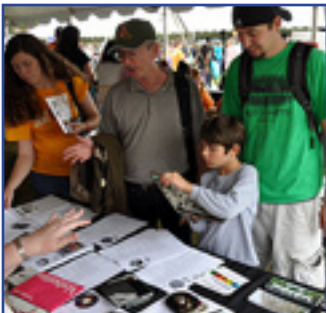
Visitors at the 2011 National Book Festival.