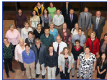
Participants in the DPOE Train the Trainer Workshop.

By Ellen O'Donnell - Sponsored by the Digital Preservation Outreach and Education program ,