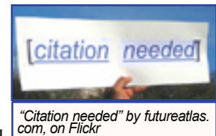
“Citation needed”

There has been a steady stream of big, serious reports from big, serious organizations about the importance of data to drive economic and technological innovation. The White House National Science and Technology Council, for example, issued Harnessing the Power of Digital Data for Science and Society in 2009. The report presented a vision for preserving federally funded research data and making it broadly accessible.