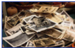
Family History for Sale.