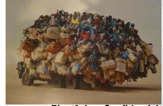
Pivot3, Inc. Confidential