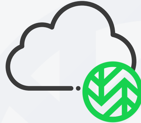
Wasabi Cloud Storage