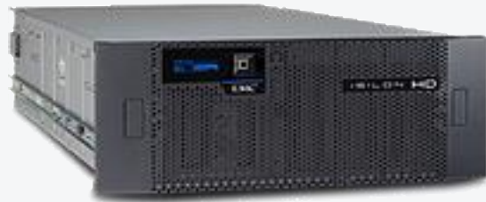
Dell Isilon X410