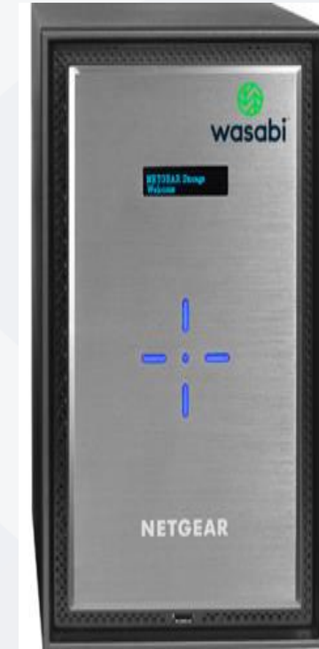
Wasabi Ball Transfer Appliance