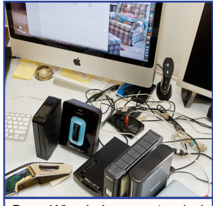
Barry Wheeler's computer desk and archive drives.