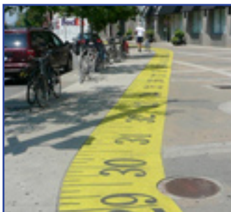
Measuring West

“ The Signal ” featured blog posts about recent activities of two of the five National Digital Stewardship Alliance Working Groups .