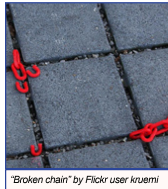
“Broken chain”

By Nicholas Taylor – What is the average lifespan of webpage? Predictably, estimates vary and vary over time. A 1997 special report in Scientific American claimed 44 days. A subsequent 2001 academic study in IEEE Computer suggested 75 days. More